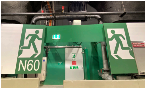
Sydney, North Connex Tunnel